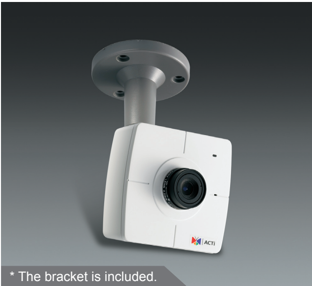
* The bracket is included.