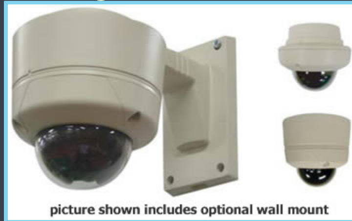
picture shown includes optional wall mount